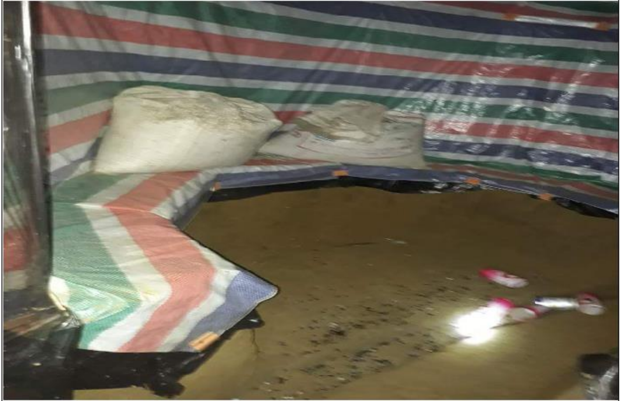
Tunnels, used by Bengali terrorists along Mayu Range