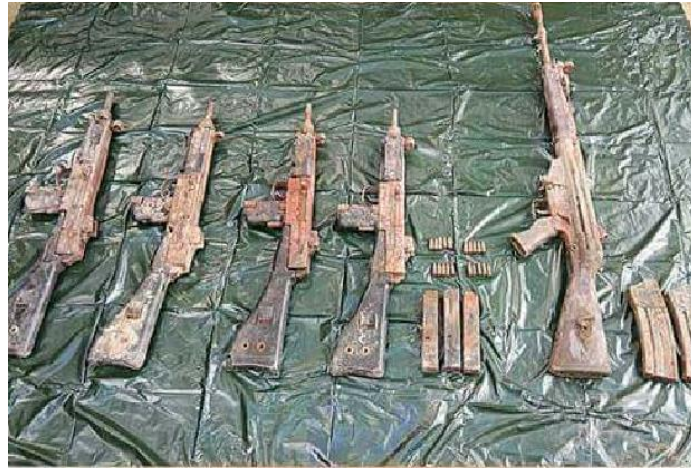
Brought back Weapons, Taken away Border Guard Police Outposts by Bengalis