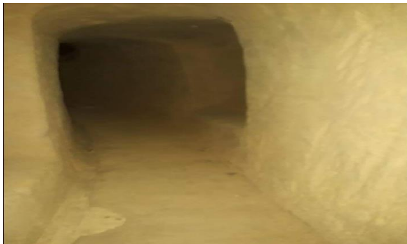
Tunnels, used by Bengali terrorists along Mayu Range