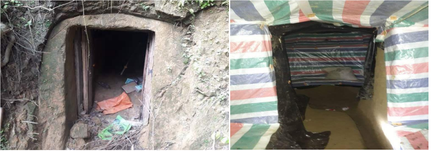
Extremist bengali people's hidden tunnel for the camp at Thinbawgway Village