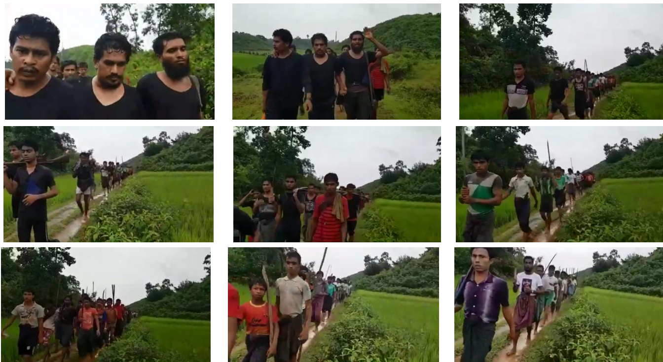
The Bengalis who were supposed to be involved in Kyeekanpyin attack