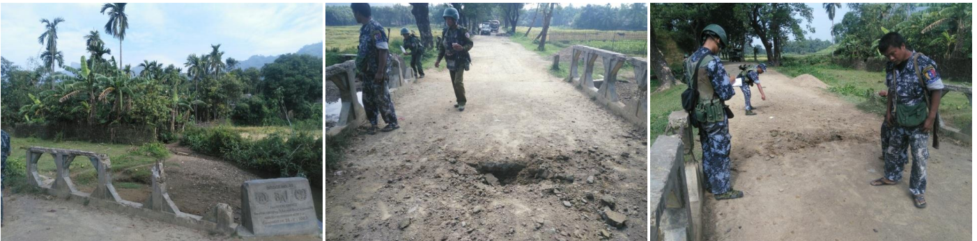
The IED blast near No.(38) Bailey Bridge at the Entrance of Maungnama (South) Village