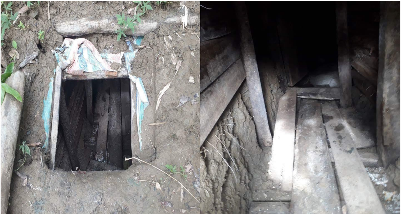
Extremist Bengali people's hidden tunnel for the camp at Kyaukpandu Village