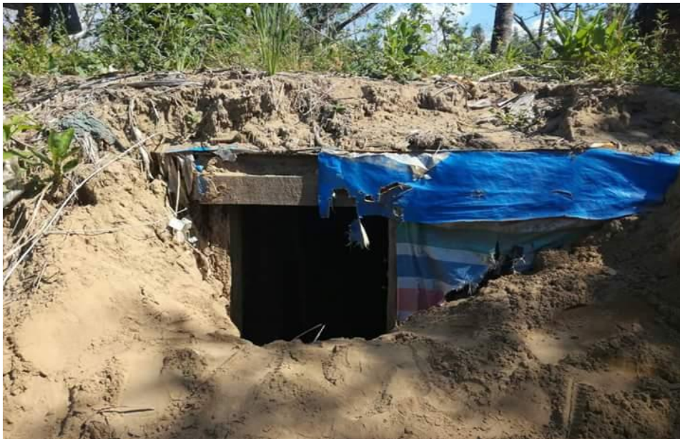
Extremist bengali people's hidden tunnel for the camp at Kyaukpandu Village