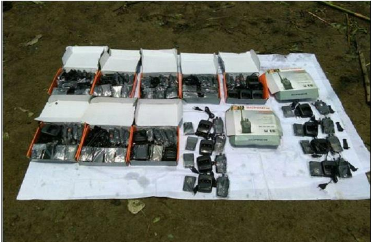
Seized Walkie-Talkie from Bengalis