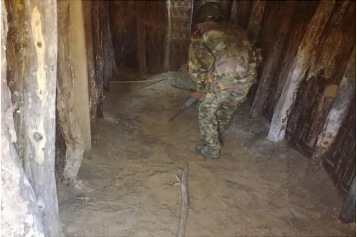
Extremist bengali people's hidden tunnel for the camp at Kyaukpandu Village