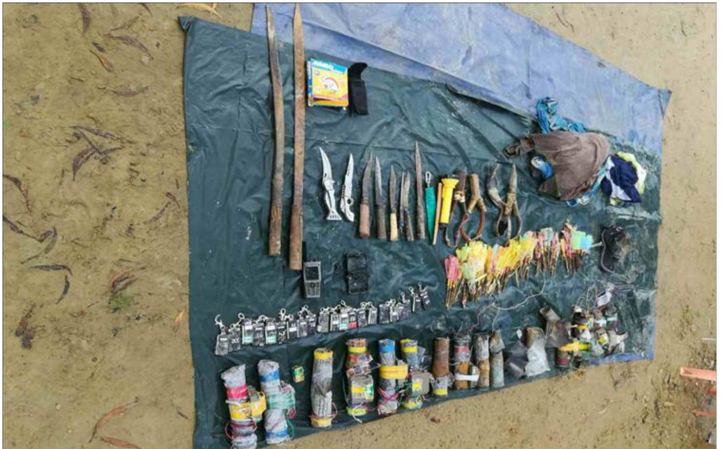
Hand-made Mines, Swords and Jinkali from Bengalis, Seized by No. 552 Light Infantry Regiment