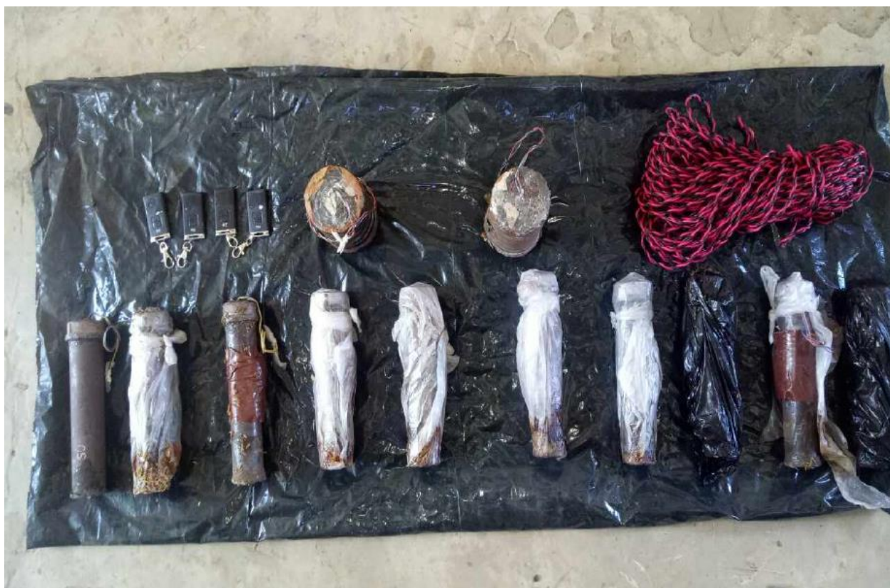
Seized Weapons from Bengalis