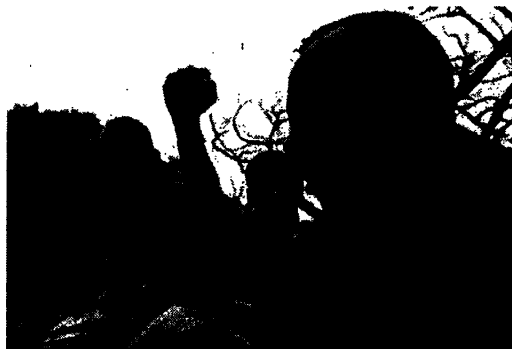
Soldiers of Sudan People's Liberation Movement's northern arm (SPLM) drive through South Kordofan in 2011

The Sudan Revolutionary Forces (SRF), an alliance of rebel groups including the Sudan People's Liberation Movement North (SPLM-N) and the Darfur rebels Justice and Equality Movement (JEM), the Sudan Liberation Movement of Abdel Wahid Nur (SLM-AW), and the Sudan Liberation Movement of Minni Arkoi Minnawi (SLM-MM), announced the battles in a statement released Sunday.