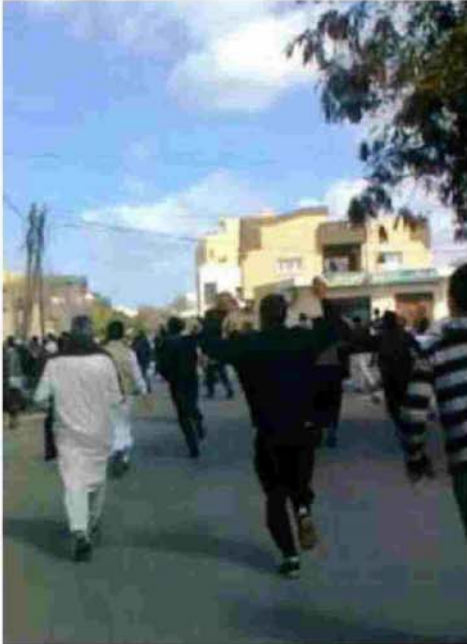
Tripoli protesters today, running away from gunshots

But there are also protesters that are armed and supported by security units that have shifted sides. These are able to engage in shorter fights, even at times attacking the central Tripoli Green Square, which is mostly dominated by a few hundred pro-Ghaddafi "protesters" and loyalist troops.