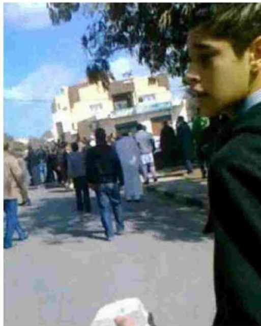
Protesters of all ages today defied the regime's terror in Tripoli

Then, desperate armed units regroup, heading towards the protesters, using live