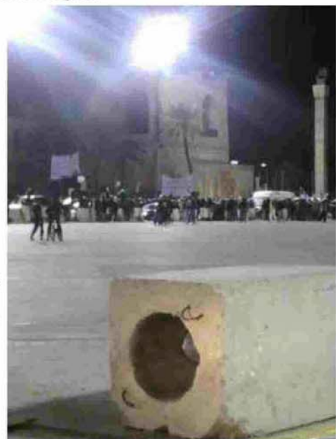
A small group of pro-regime protesters in central Tripoli