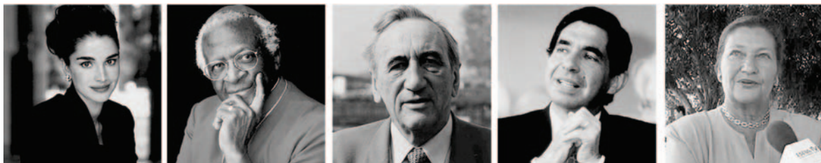
Board of Directors, Trust Fund for Victims

Extract from the speech by Ms Simone Veil, Chair, Board of Directors, Trust Fund for Victims. Third Session of the ASP, 6 September 2004