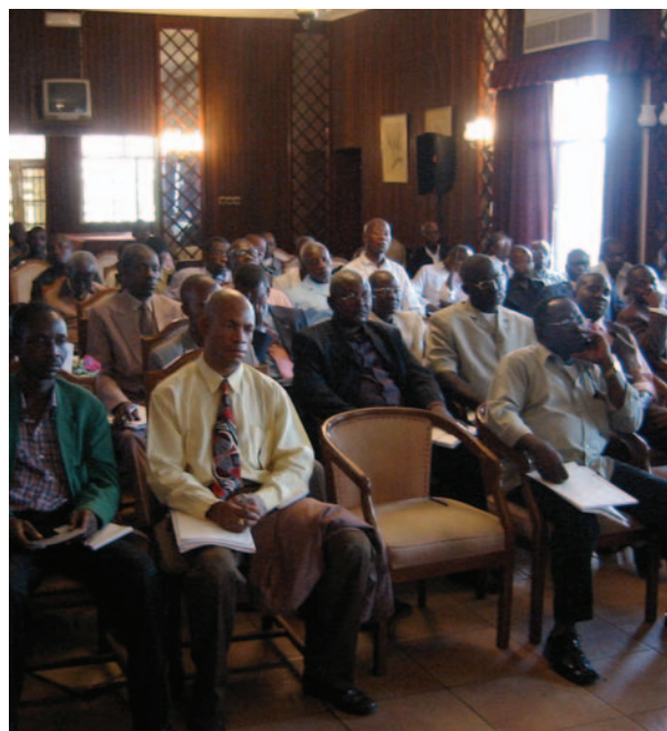
ICC Seminar Kisangani

On Thursday 2 April, members of the delegation from the ICC Registry attended a one-day seminar organised by the Ministry of Foreign Affairs entitled "Mieux connaître la CPI, pour mieux coopérer" ( facilitating cooperation through a better knowledge of the ICC ).