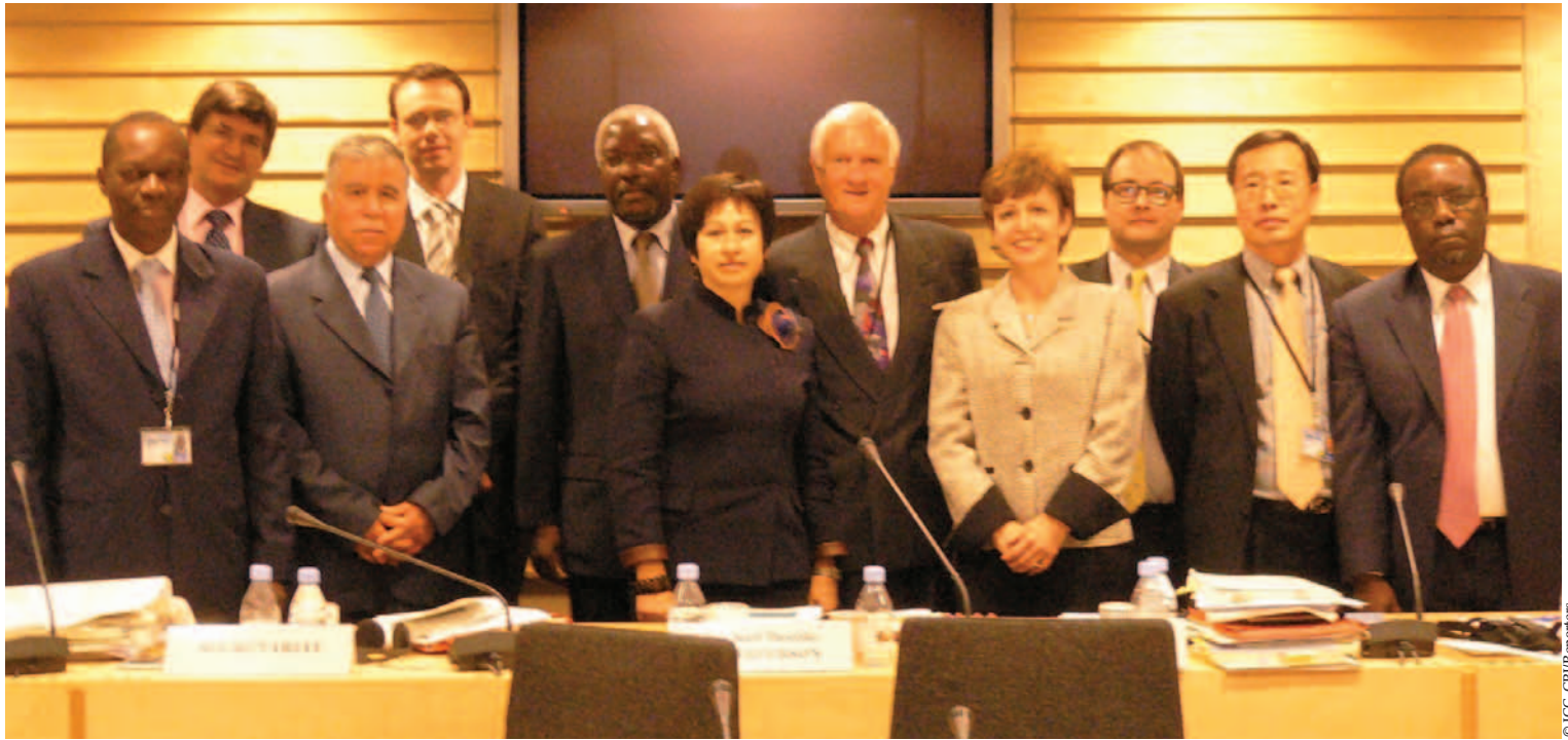
The Committee on Budget and Finance – Fourth Session