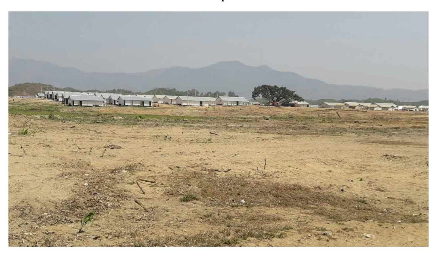
Temporal shelters at Hla Poe Kaung Village for repatriations of the Bengalis