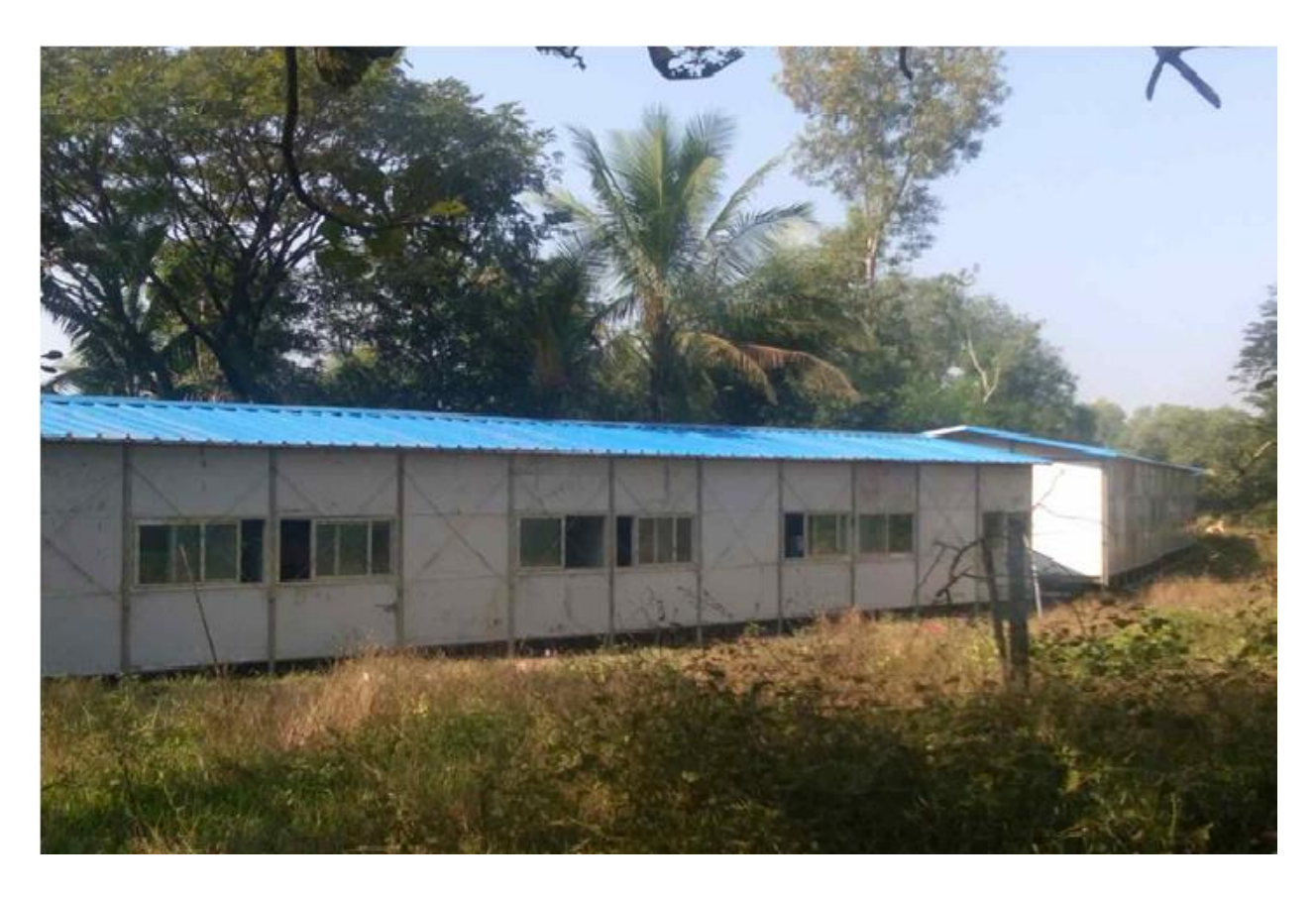
The camp Nagakhuya built for repatriations of the Bengalis