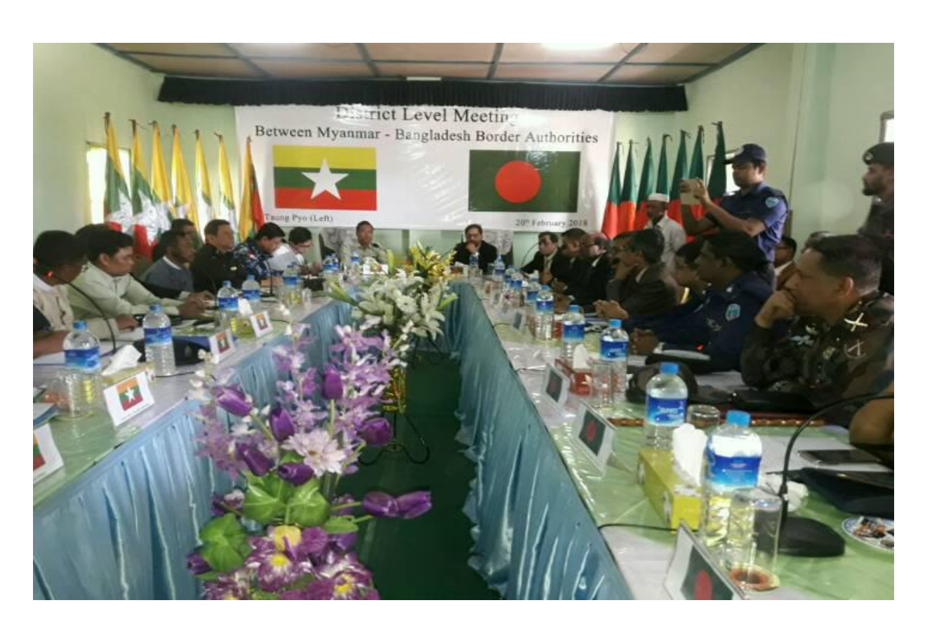
Meeting between Maungdaw District Administrator and Chittagaung Administrator at the Taung Pyo Let Wal Township Administrative Office for repatriation of the Bengalis