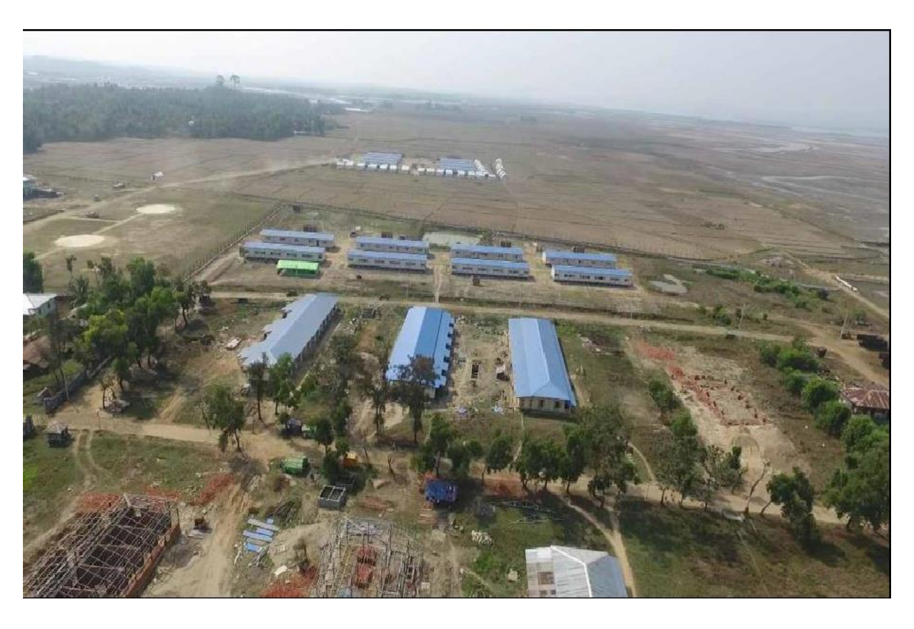
The camp Ngakhuya built for repatriations of the Bengalis