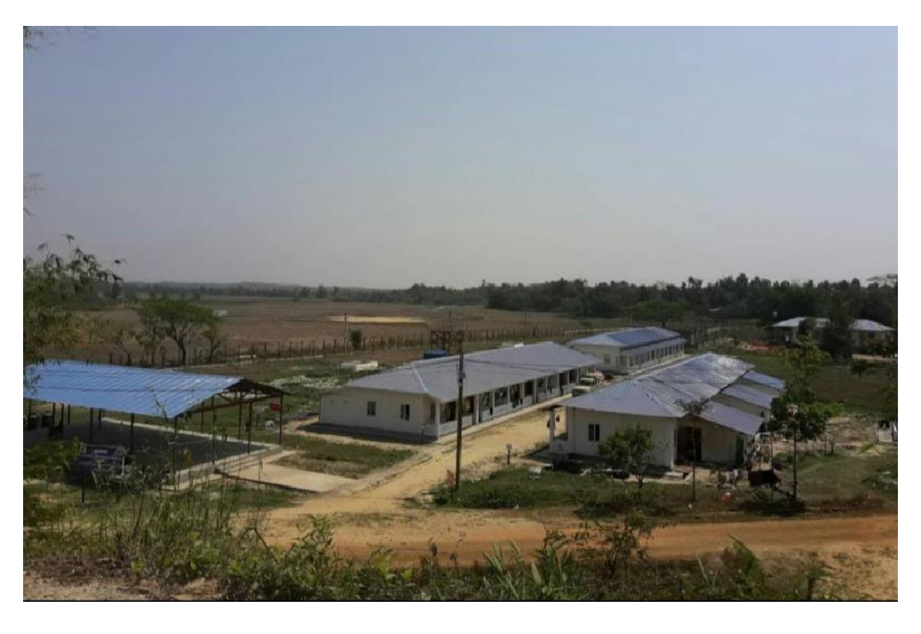
The camp Taung Pyo Let Wal built for repatriations of the Bengalis