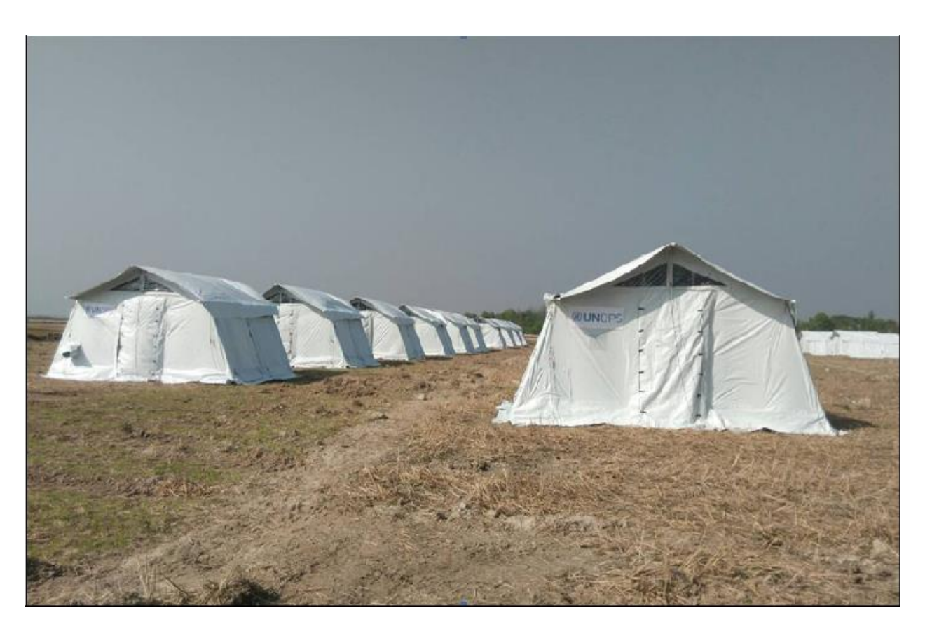
Temporal shelters at Hla Poe Kaung Village for repatriations of the Bengalis