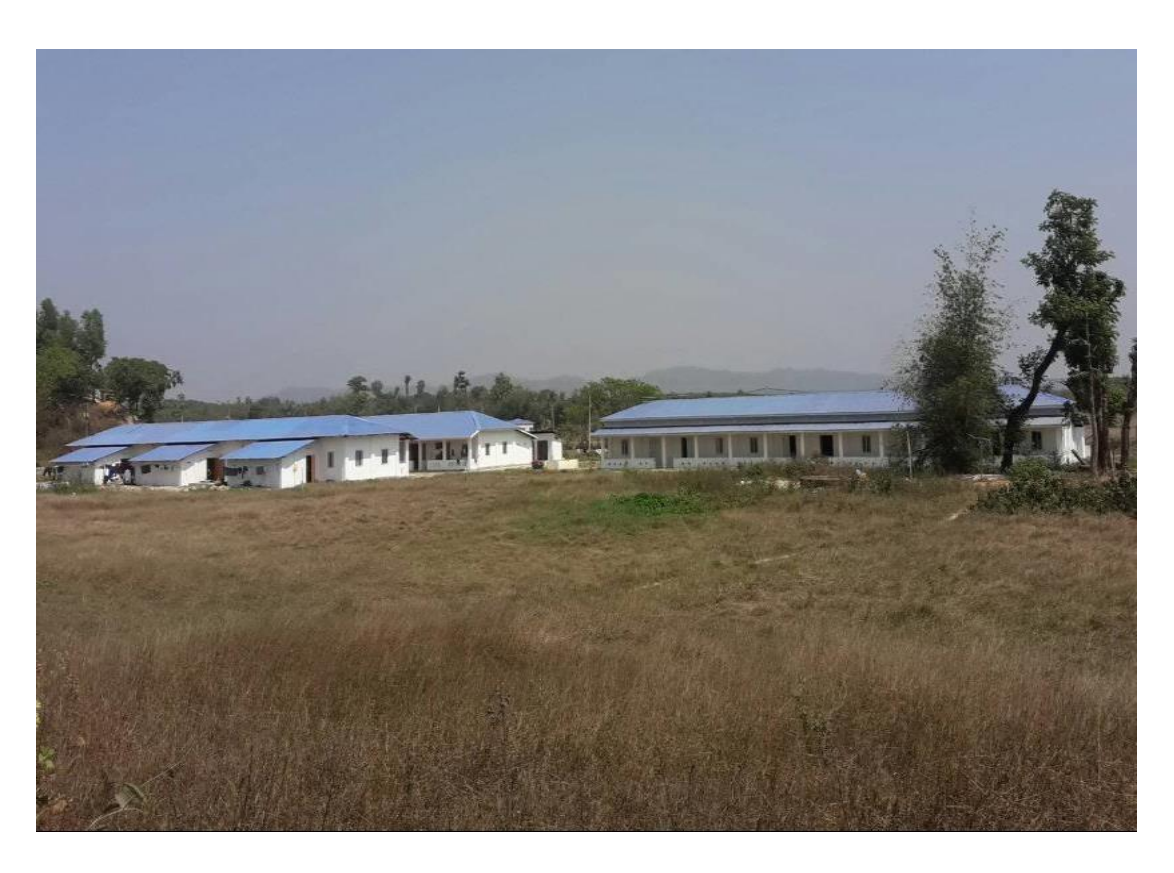
The camp Taung Pyo Let Wal built for repatriations of the Bengalis