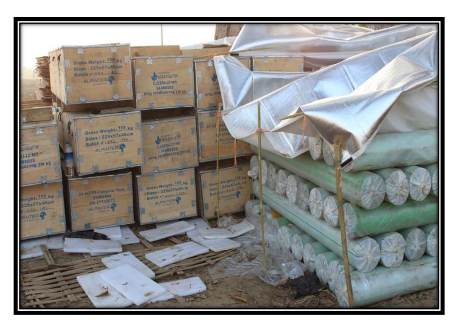
Heaps of the accessories for construction of temporal shelters at Hla Poe Kaung Village