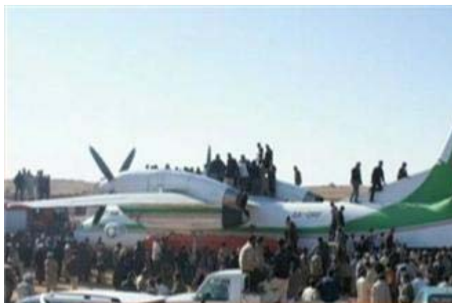
Saif al-Islam was flown by his captors to the town of Zintan where a large crowd greeted the airplane

After the brief exchange with the heavily bearded prisoner, Libyan Reuters journalists who have met Saif al-Islam said they had no doubt that was indeed him, although he repeatedly declined to confirm his identity outright.