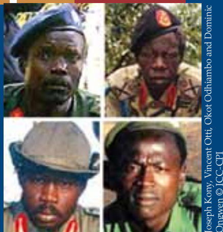
Joseph Kony, Vincent Otti, Okot Odhiambo and Dominic Ongwen