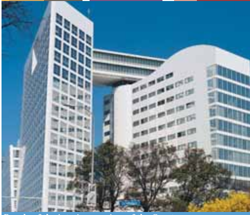
Facade of the interim premises of the Court