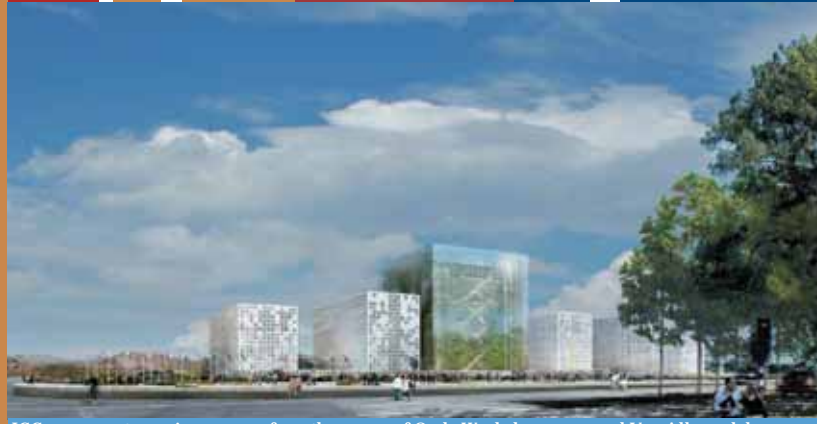
ICC permanent premises as seen from the corner of Oude Waalsdorperweg and Van Alkemadeaan ©schmidt/hammer/lassen architects