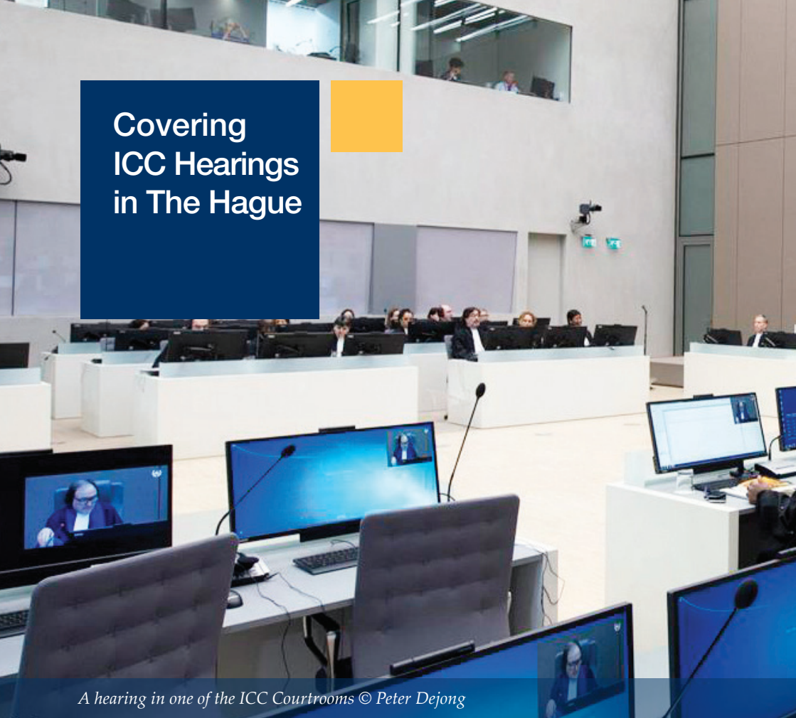
A hearing in one of the ICC Courtrooms

Due to the evolving COVID-19 situation, please check latest information and requirements on access to the buildings at: