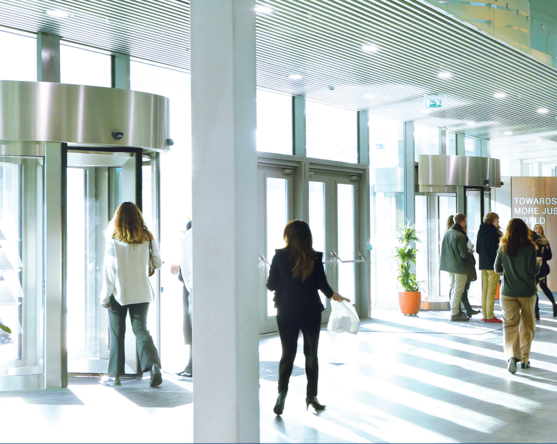
The main lobby of the International Criminal Court