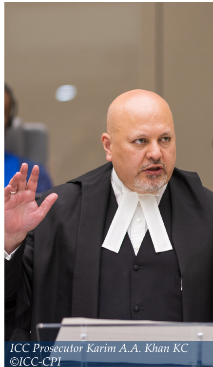
ICC Prosecutor Karim A.A. Khan KC