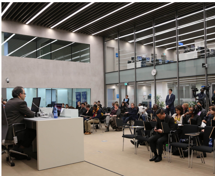
The ICC spokesperson speaks to journalists in the Court's press briefing room

To request an interview with ICC officials, please use the interview request form in Annex 1 of this guide which will help ICC press officers to swiftly answer your request and send it by e-mail.