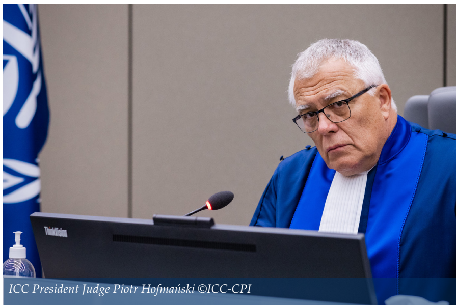
ICC President Judge Piotr Hofmański